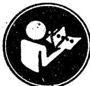
Label Read Owner's Manual