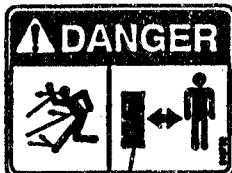
Label Danger Flying