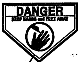
Label Danger Keep Hands and Feet Away